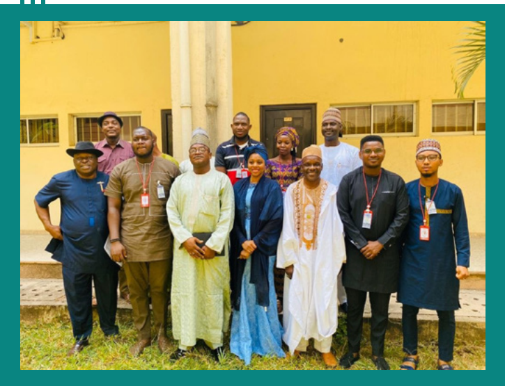
CODE staff with members of the ICPC after the advocacy meeting

On the 20th of March, 2020, in order to foster partnership with the ICPC, on the Money trail project, CODE embarked on an advocacy visit to the commission. Some top officials were present including board members of the ICPC. Various issues were discussed during the meeting, including the prosecutorial efforts on the case, challenges and possible roadmaps to address IFF, especially in the extractive sector where it is more susceptible. The team gathered that the ICPC had little investigative and prosecutorial nexus with the Malabu Scandal as they stated that the Economic and Financial Crimes Commission (EFCC) undertook bulk of the investigation and prosecution from inception.